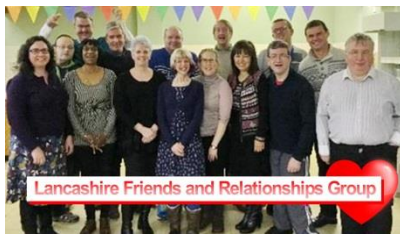
Lancashire Friends and Relationships Group