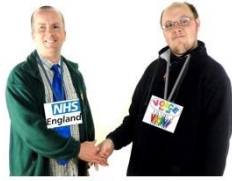
NHS Greater Preston Clinical Commissioning Group NHS Chorley and South Ribble Clinical Commissioning Group

We continue to meet and work with all our partners across Lancashire and the North West. We are presently meeting and working with;