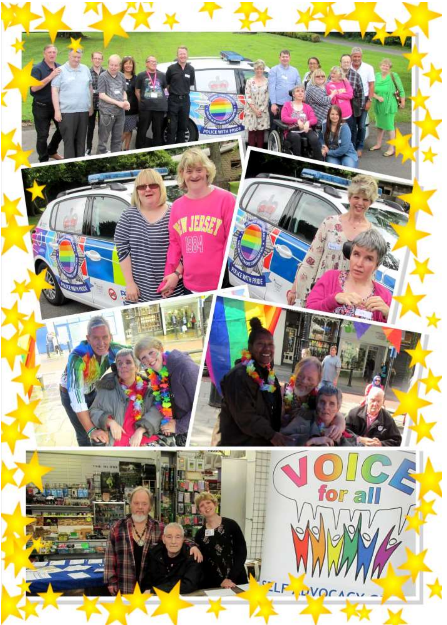
A few photographs of what we've been up to, including LGBT+ events, Preston Pride, Chorley Recruitment event...